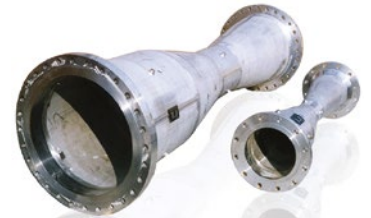
ABB are specialists in the engineering and supply of venturi tubes in the demanding applications found in oil and gas, petrochemicals and process industries. Many units are in use in Liquefied Natural Gas (LNG) plants, Gas to Liquids (GTL) processes and in refining.

ABB Venturi tubes offer excellent resistance to wear and consequently require virtually no maintenance. They have a very long service life which is typically the whole life of the plant on which they are installed. They produce a low net pressure loss and therefore reduce energy costs by typically 20 to 25%, with a consequent reduction in greenhouse gas emissions. Wide range of sizes and materials to match application.