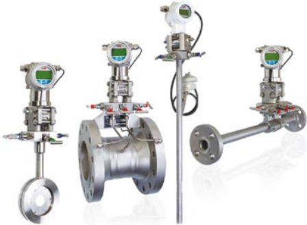
ABB Differential Pressure flow products provide world-class measurement solutions for any industry.

Latest innovations in DP primaries and transmitters deliver technological solutions to make it easier for you to run your plant efficiently and economically.