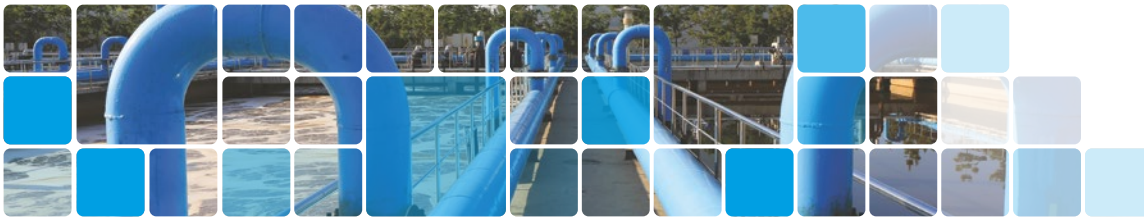
ABB ELECTROMAGNETIC FLOWMETERS